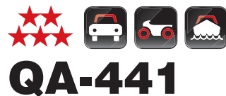
QA-441 HEAVY DUTY MICRO AIR DIE GRINDER A:3mm B:1/8" Air inlet : 1/4"