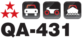
QA-431 A:3mm B:1/8" MICRO AIR DIE GRINDER Air inlet : 1/4"