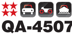
QA-4507 A:6mm B:1/4" MICRO AIR DIE GRINDER Air inlet : 1/4"