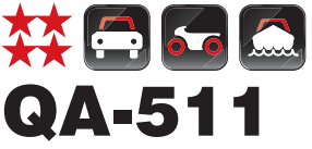
QA-511 ENGRAVING PEN Air inlet : 1/4"