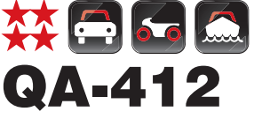
QA-412 A:3mm B:1/8" MICRO AIR DIE GRINDER Air inlet : 1/4"