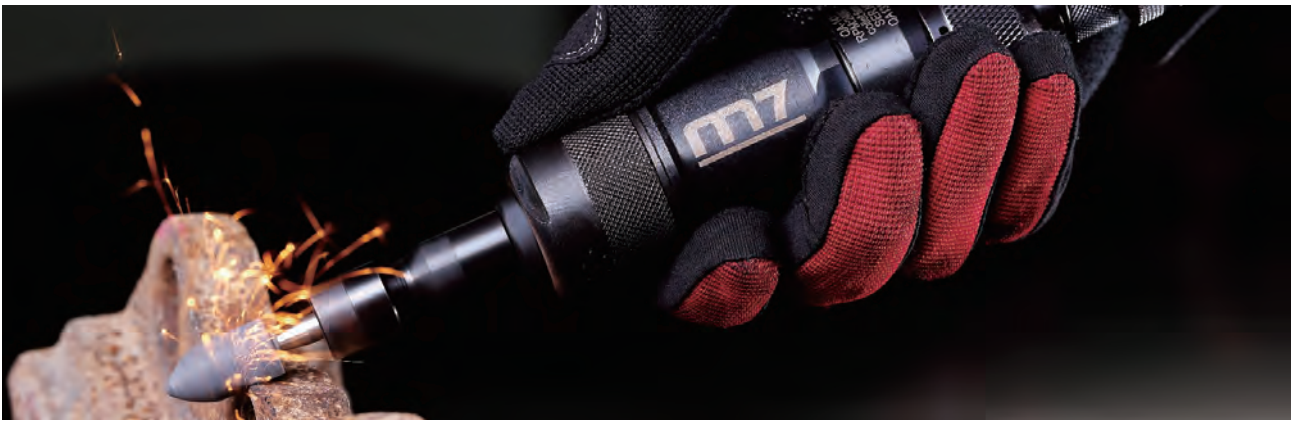
Air die grinder