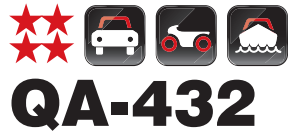
QA-432 A:3mm B:1/8" MICRO AIR DIE GRINDER Air inlet : 1/4"