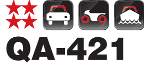
QA-421 A:3mm B:1/8" MICRO AIR DIE GRINDER Air inlet : 1/4"